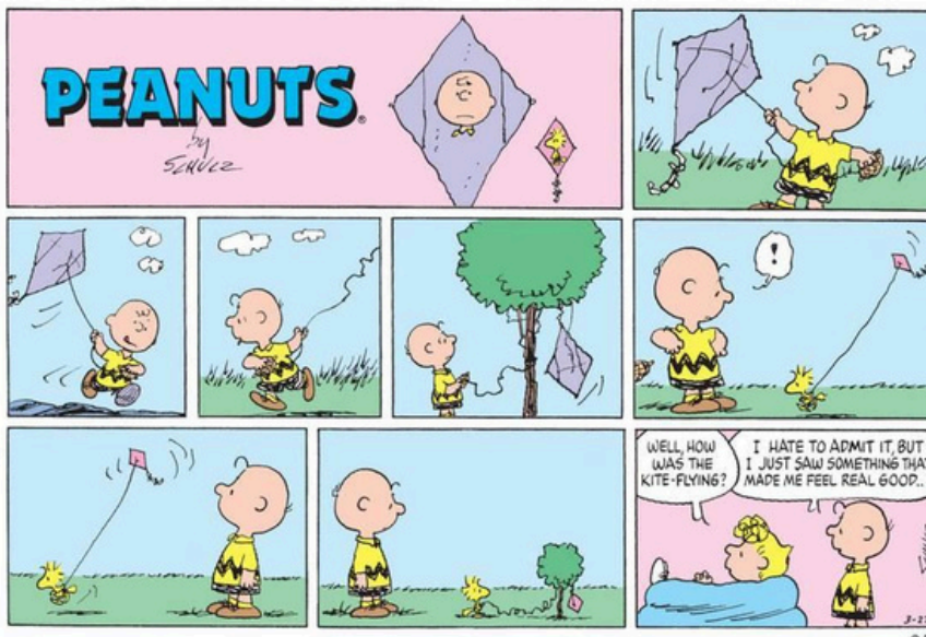
This is so dang cute and funny not to share.

The leadership team is always open to hearing feedback from you. Email us through the club website at www.sandiegokiteclub.org .